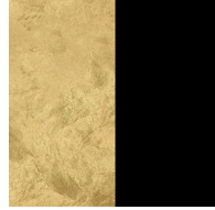
White/White - WHW

Digital: Not all screens are calibrated the same, and therefore, colors will appear differently between screens.